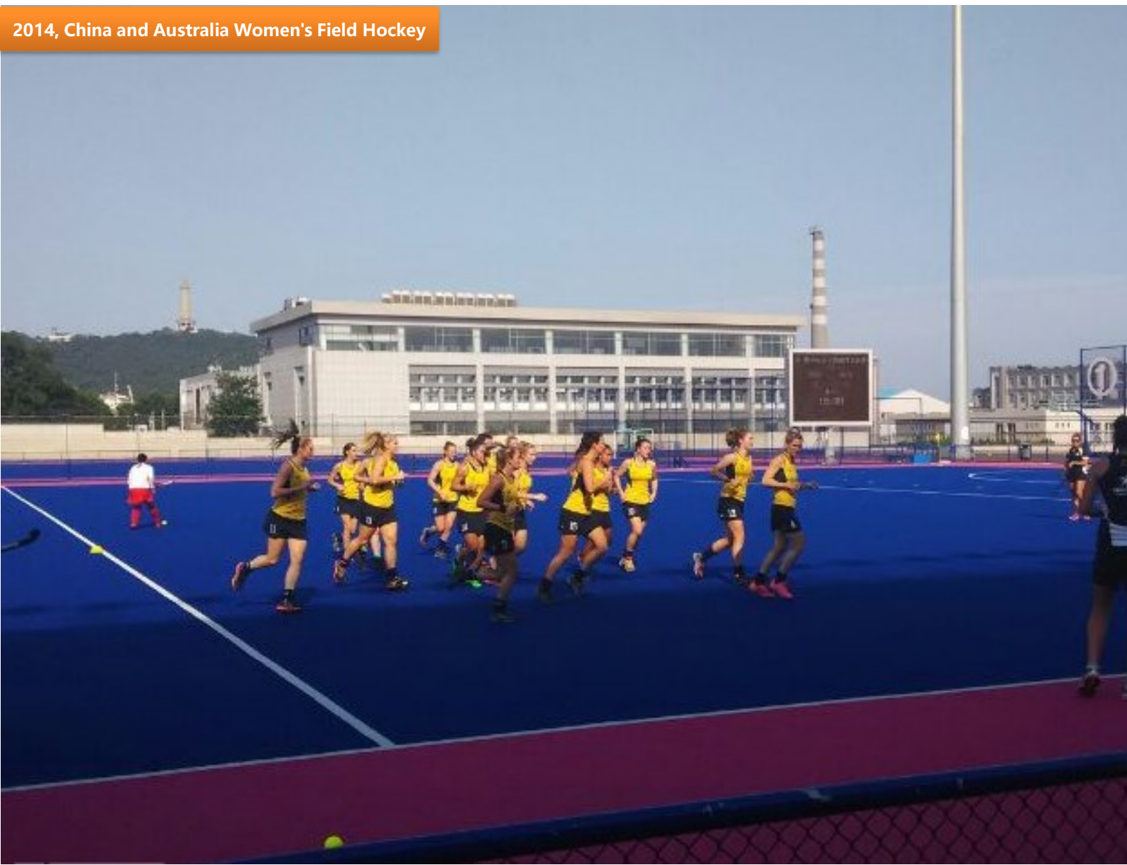
2014, China and Australia Women's Field Hockey

It is an ideal choice for most of smart and professional stadiums.